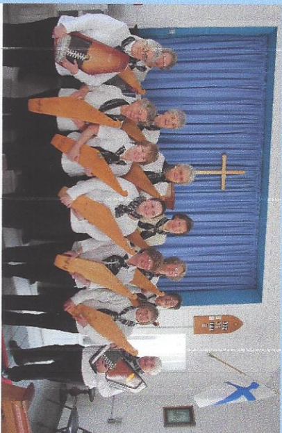
2013 Kantele Ensemble

Created to preserve and promote cultural education along midcoast Maine through the arts and music.