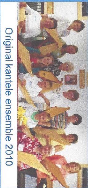
Original kantele ensemble 2010

Kantele players of varying backgrounds have inspired others to join their bi-weekly rehearsals. Many newcomers blend additional folk instruments to enrich the sounds of the kanteles.